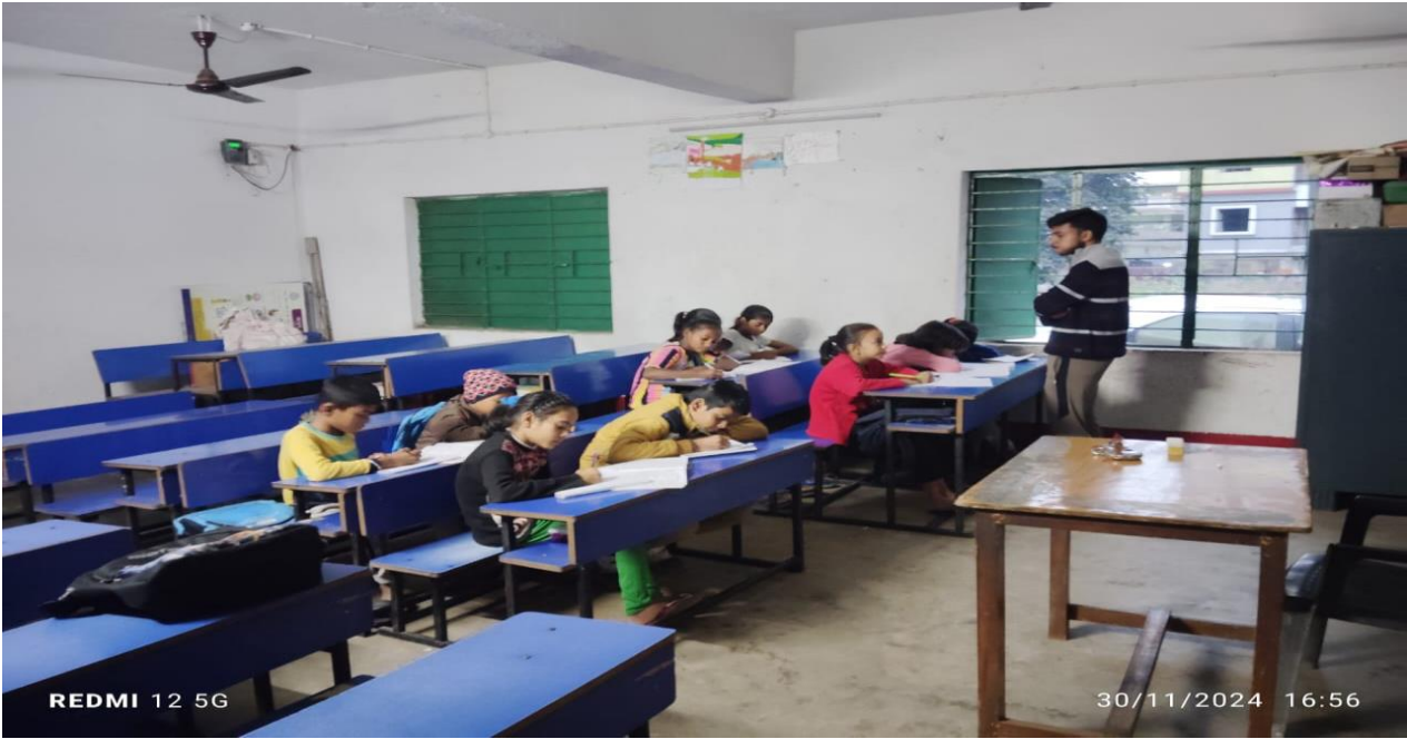
7. Regular Classes at Giridih based centers.