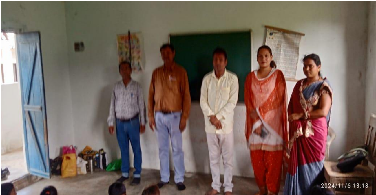
6. Regular Classes at Navodaya Centre.